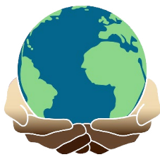
Give to the World