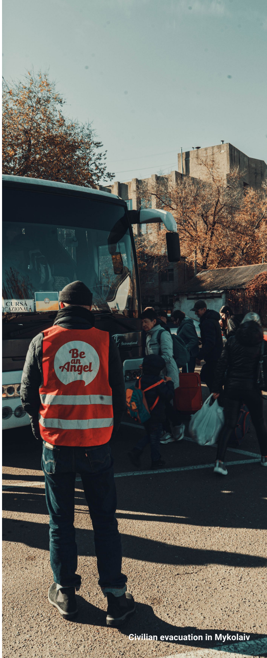
Civilian evacuation in Mykolaiv

We invite you to join our efforts. Together we are stronger. Together we can help more people. Together we can be Angels.